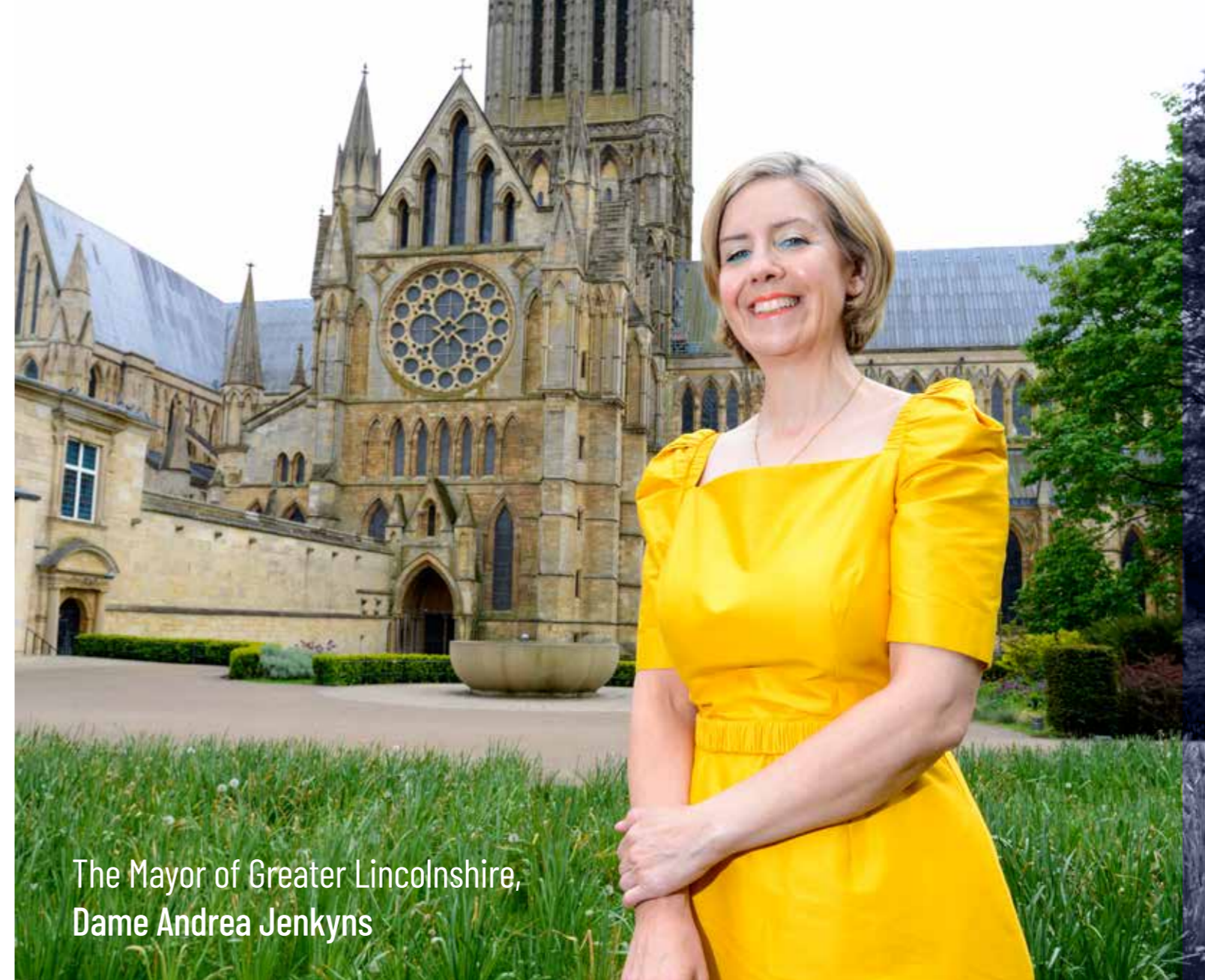
The Mayor of Greater Lincolnshire, Dame Andrea Jenkyns

The Mayor added: "Devolution must deliver benefits for every business. By harnessing the expertise of this panel, we can close the productivity gap, improve transport and housing and build the skilled workforce our economy needs."